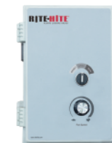
Fan Control Box