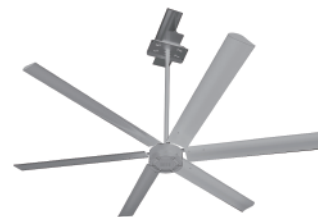
8', 12' Fan