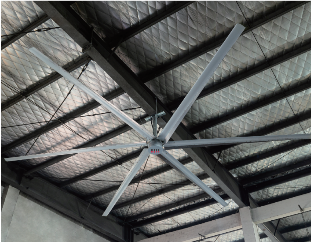
16', 20', 24' Fan

Climate control with direct drive technology.