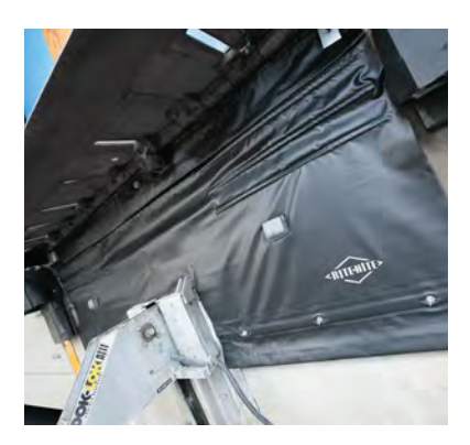
PitMaster Under-leveler Seal