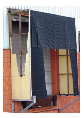
Just one trailer impact can severely damage or even destroy ordinary rigid-frame dock shelters.