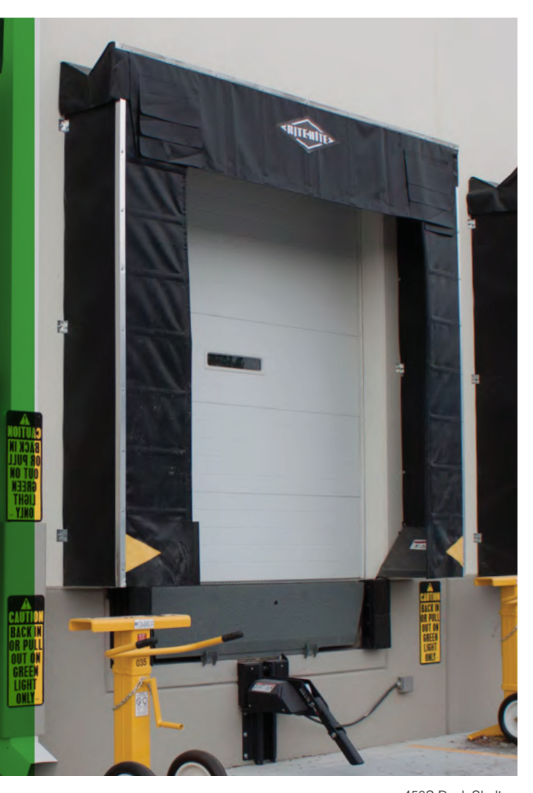
450S Dock Shelter.