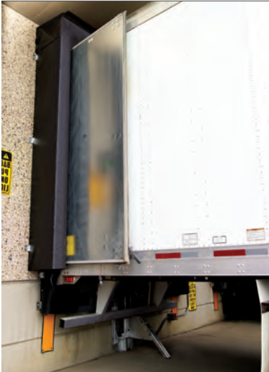
Side frames are impactable for long-term durability.