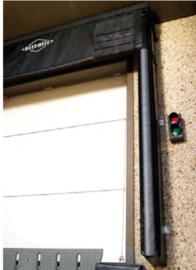
6"-wide (152 mm) side frames allow shelter to fit into narrow spaces.