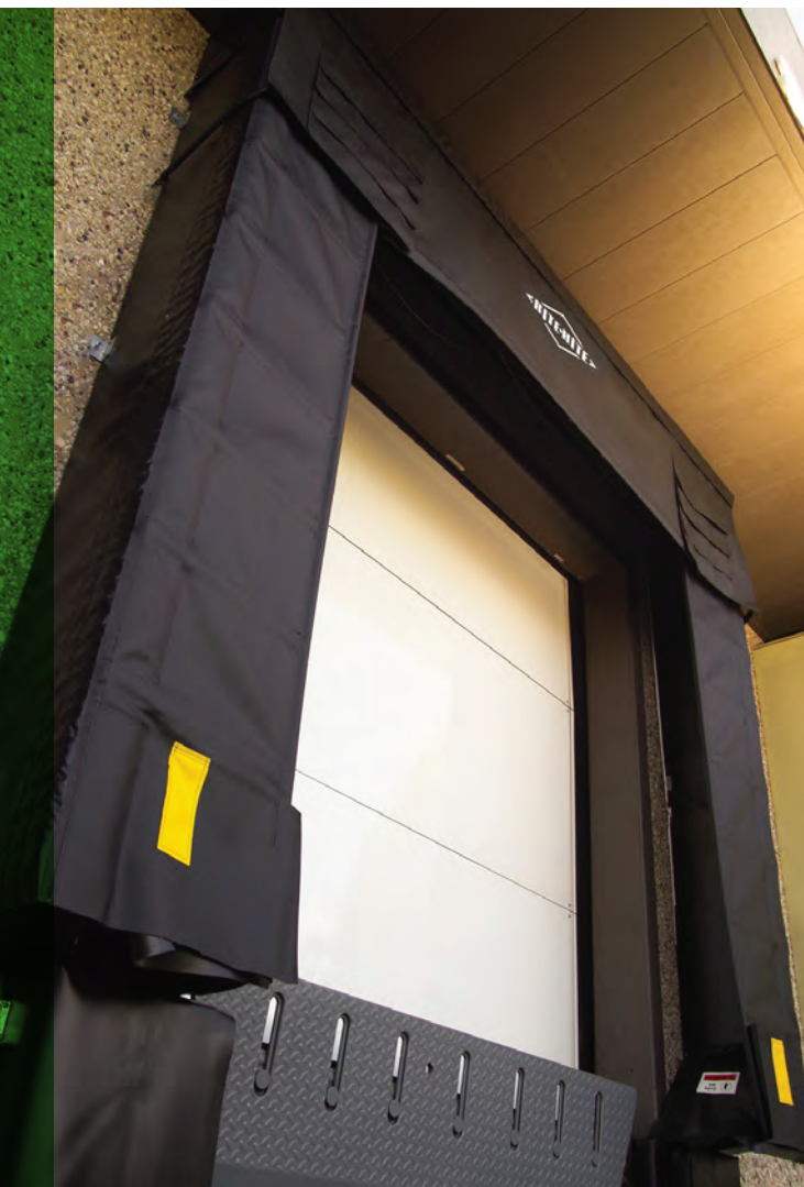
610C Dock Shelter