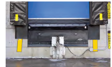
PitMaster Under-leveler Seal.

Endura (610C) delivers all these exclusive benefits, and are backed by a standard 36-month money-back customer satisfaction guarantee when ordered with premium Rite-Hite® fabrics.