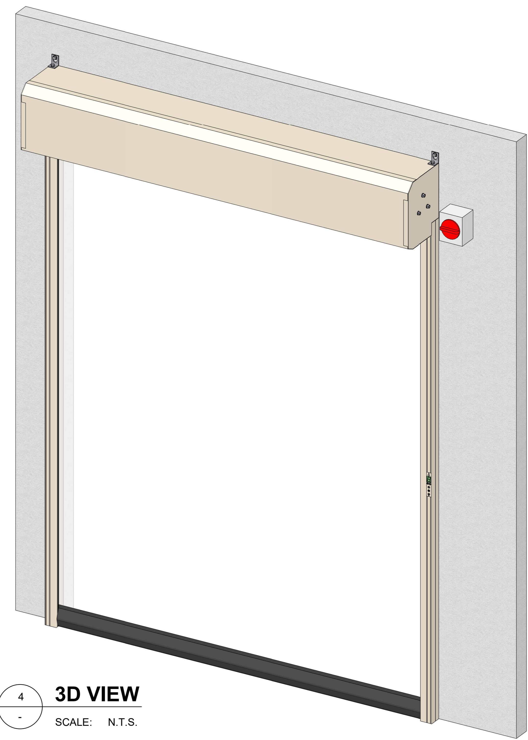
4 3D VIEW SCALE: N.T.S.