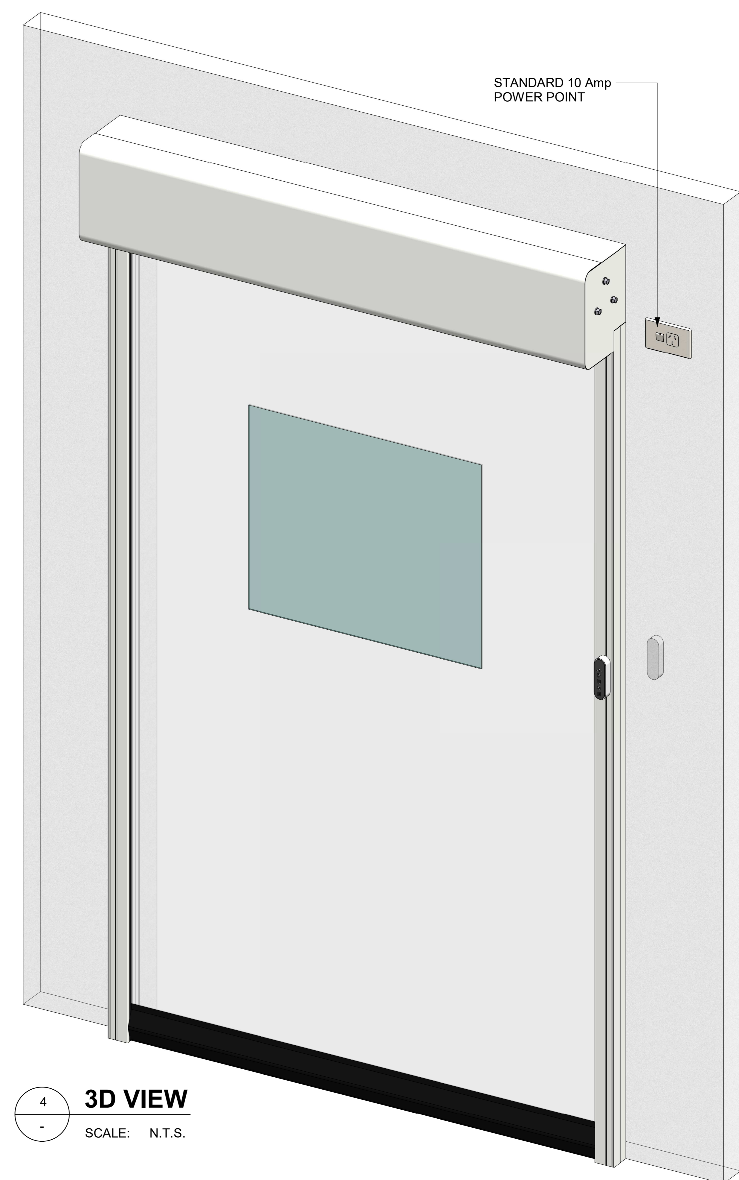
4 3D VIEW SCALE: N.T.S.