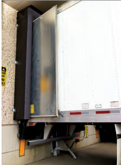
ComboShelter side frames are impactable for long-term durability.