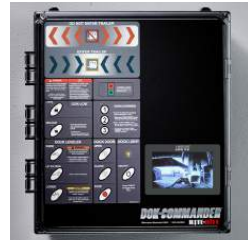
Dok-Commander control panel (optional).

Available interconnect system reduces risk of damage if unit not deflated/retracted before trailer pulls in or out.