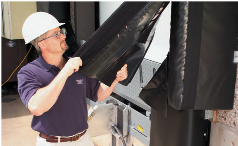
Removable side curtains allow for maintenance flexibility.