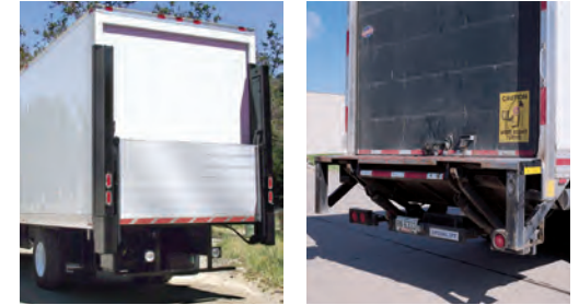
ComboShelter enclosure seals liftgate and step ledge trailers, as well as standard over-the-road trailers.

When sealing a variety of trailers that includes liftgates, extending the projection of the unit is only the start. To prevent wear from curtain “backlash” that occurs when standard trailers pull away from the dock, insides of the Uni-Combo Shelter side curtains are specially reinforced. Plus, stable narrow side frames provide increased flexibility and further wear protection.