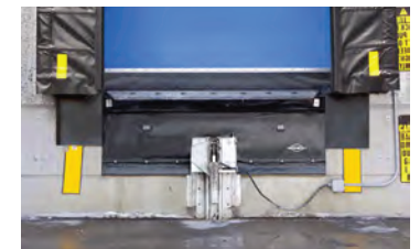
PitMaster Under-leveler Seal.

Gaps large and small beneath and around the dock leveler are sealed with optional PitMaster components, providing substantial energy savings, improving cleanliness and sanitation.