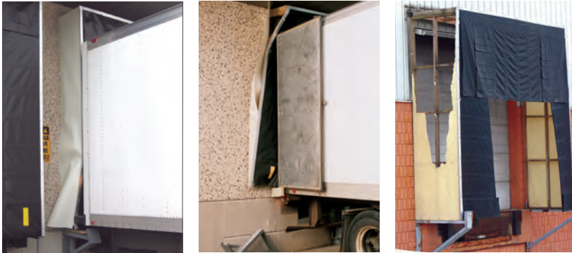
Just one trailer impact can severely damage or even destroy ordinary rigid-frame dock shelters.