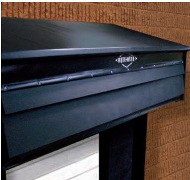
RainGuard Header Seal.