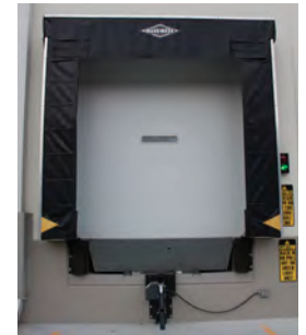
Survivor Dock Shelter.

And, since Survivor frames can be compressed all the way back to the dock bumpers, there is no need for additional protective steel bumpers out front.