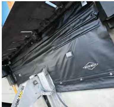
PitMaster Under-leveler Seal.