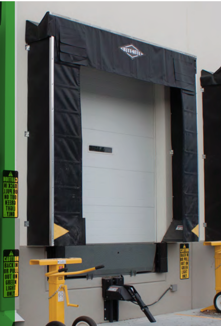
Rite-Hite® Survivor Dock Shelter.