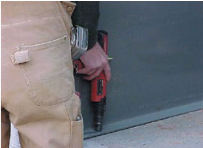
Anchor to pit floor - Helps assure squareness.