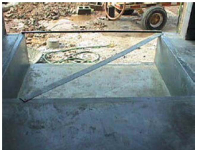
Remove squaring bars - Ready for leveler installation