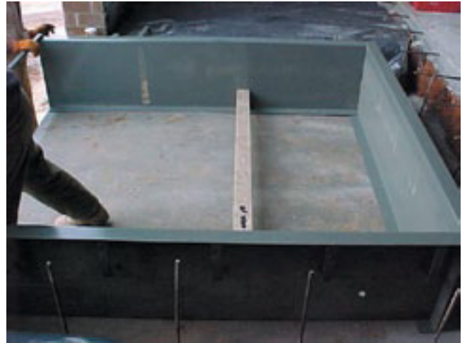
Set Dok-Box in place with squaring members - NO FORMS REQUIRED.