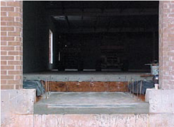
Pour pit floor.