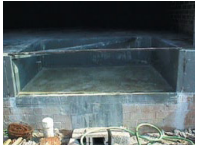
Pour around Dok-Box.