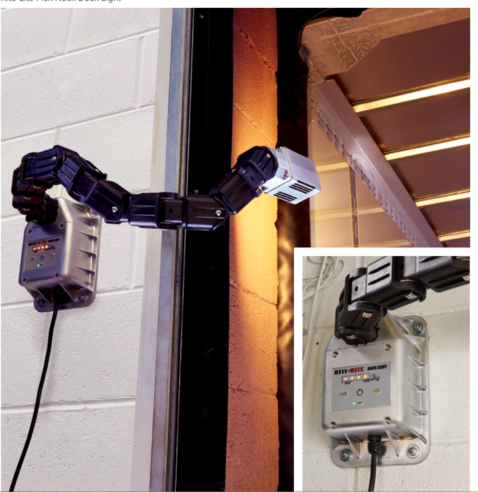
Rite-Lite Flex Neck Dock Light

Enhance productivity, safety and energy efficiency at your loading dock.